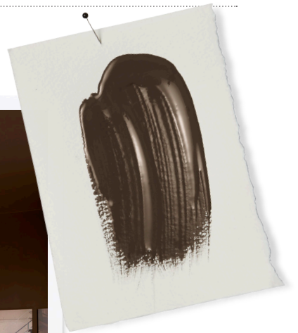
ESPRESSO BEAN CSP-30 BENJAMIN MOORE

“Winter months in Canada are long and cold, so we often bring in dark, moody colors to add warmth and coziness. The guest room of our Toronto apartment feels like a box of chocolates, with all four walls and the ceiling enveloped in this inviting brown. It’s a decadent treat for overnight visitors!”