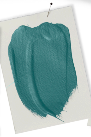
VARDO NO. 288 FARROW & BALL

“I find that the scale and opulence of contemporary Arabian architecture suits dramatic paint colors like this rich turquoise, which I used in an entrance hall in Kuwait. The 16-foot ceiling provided a terrific expanse of wall to showcase a stunning shade that perfectly matched the oxidized copper cladding on the central staircase.” KATHARINE POOLEY