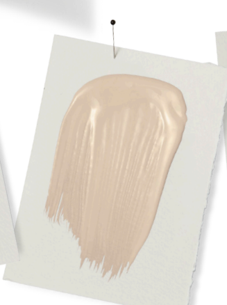
SETTING PLASTER NO. 231 FARROW & BALL

“I find that the scale and opulence of contemporary Arabian architecture suits dramatic paint colors like this rich turquoise, which I used in an entrance hall in Kuwait. The 16-foot ceiling provided a terrific expanse of wall to showcase a stunning shade that perfectly matched the oxidized copper cladding on the central staircase.” KATHARINE POOLEY