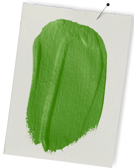
PARADISE VALLEY 559 BENJAMIN MOORE

“When it came time to paint the dressing room of a home in the Philippines, I looked to the lush landscaping and the many varieties of palm trees that surrounded the Manila apartment. I did a strié finish, much like the variegations seen on leaves, to create a sort of veining. It’s a contemporary take on tropical style.”