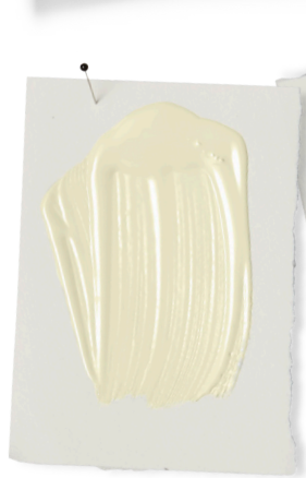
BUZZ C2-627 C2 PAINT