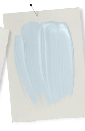
SHEER BLISS CPS-545 BENJAMIN MOORE

“It’s one of those colors that epitomizes the ideal yin and yang: strong yet subtle, calming yet invigorating. I used it for a bedroom in the Bahamas and found it to be the loveliest mix of baby blue, gray, and off-white. When the tropical sun hits, it casts the liveliest hue, but at dusk, it is the embodiment of solitude—a cool retreat after a long, hot day at the beach.”