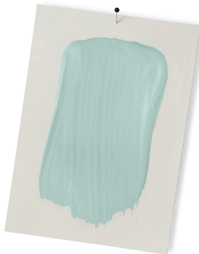
THUNDERBIRD 675 BENJAMIN MOORE

Picked for Parisian pieds-à-terre or Italian villas, these are colors that play well on a world stage—no passport required.