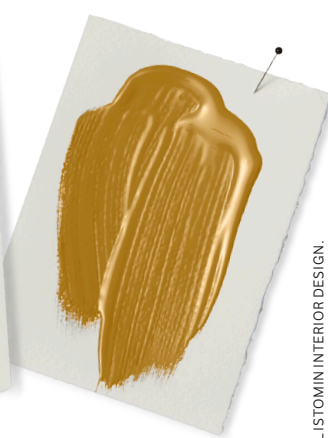
BROWND BUTTER 10-11 PRATT & LAMBERT

“We overhauled a spectacular historic home fronting Regent’s Park in London for a family who wanted to imbue the structure with warmth and color. This deep ochre, which we chose for the office, highlighted the traditional plaster details and eclectic collection of antiques and artwork. With a zebra-print rug and a lamp made from a brass helmet, it was very modern-day explorer.”