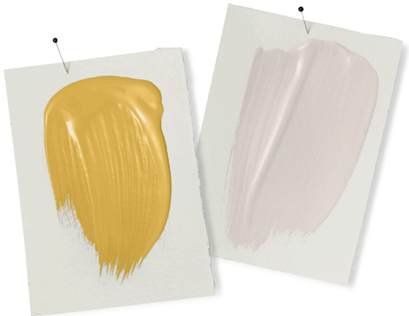
BABOUCHE NO. 223 FARROW & BALL

“My hometown of Paris might be called the City of Light, but despite this, actual sunlight is often missing! To fill the gap, I sometimes use yellow to illuminate my projects there. Slight touches of the color allow me to create bright spots that give life to the places I design.”